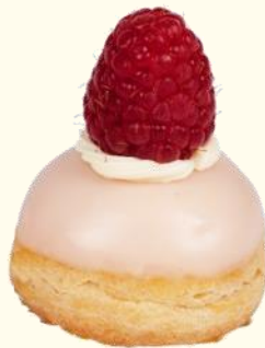
Rose & Raspberry