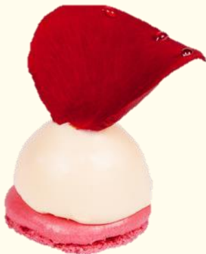
Rose and Raspberry