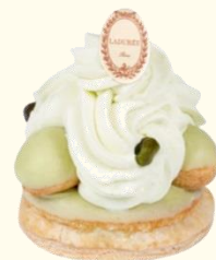
Saint Honoré Pistache