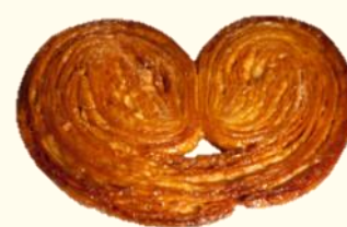
Heart-Shaped Puff Pastry