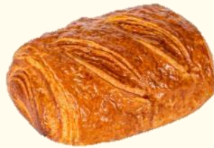
Pistachio & Chocolate Croissant