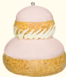
Rose & Raspberry Religieuse